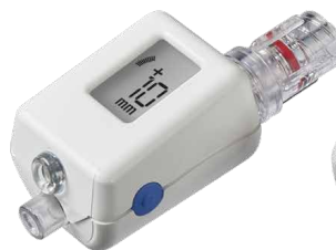
Compass UniversalHg #CUHG1-INT