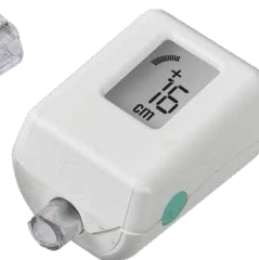
Compass Lumbar Puncture #CLPH20001-INT