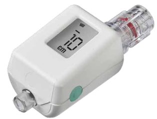
Compass Thoracentesis #CTHR002-INT