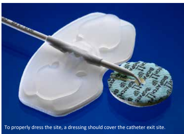
To properly dress the site, a dressing should cover the catheter exit site.

WingGuard® is a registered trademark of Centurion Medical Products Corporation.