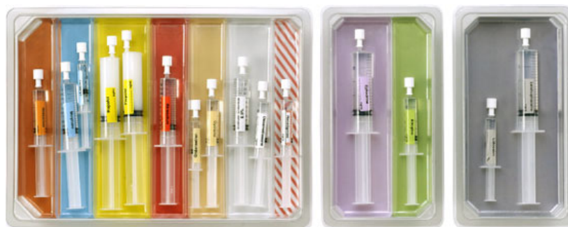
Figure 1 The Rainbow tray.